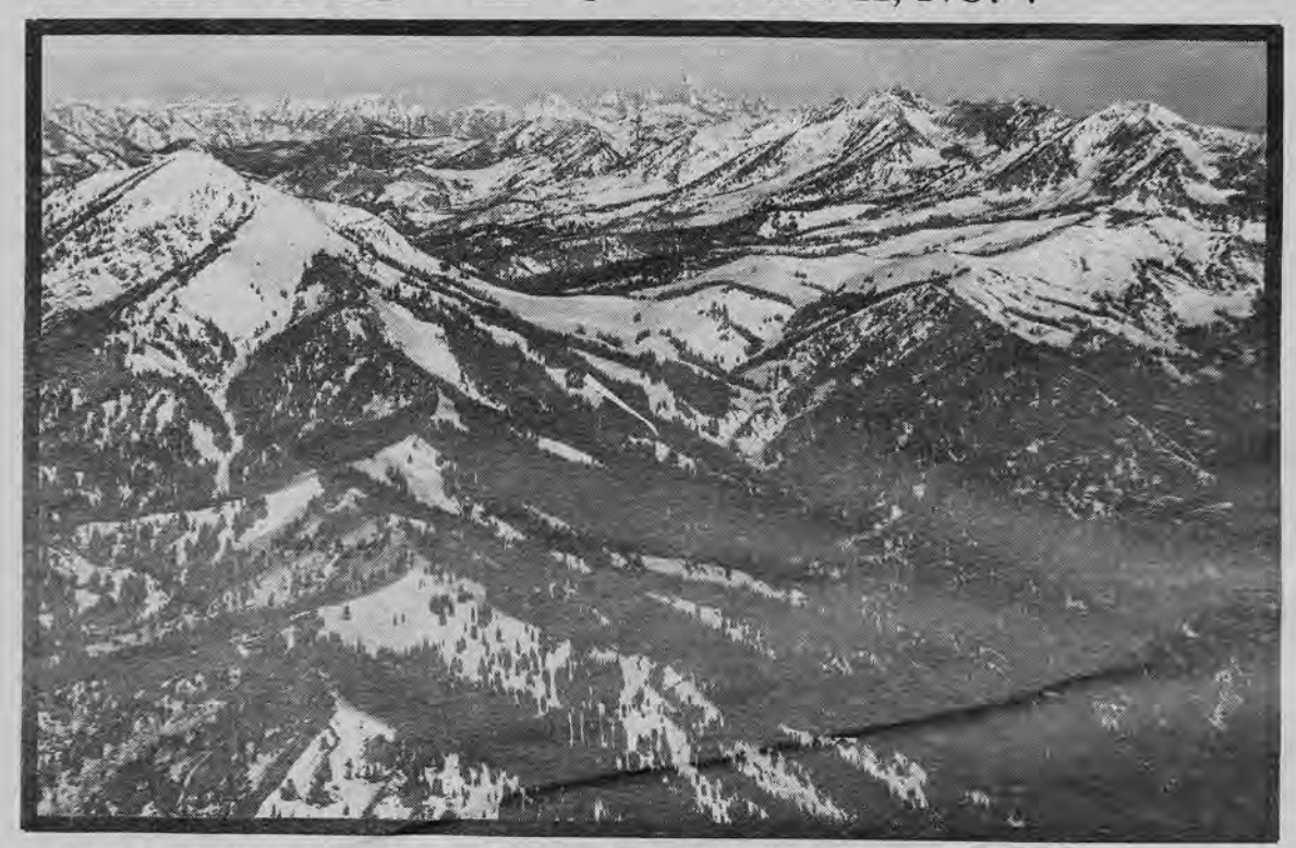
Grand Tetons in the distance-Getty's Little Granite Creek drillsite is the saddle in the foreground.